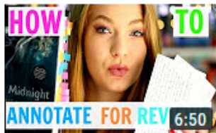
HOW I ANNOTATE MY BOOKS | IMPROVE YOUR BOOK bigscreenbooks 14K views