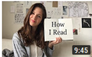
How I Annotate My Books Novel Thoughts 9.8K views