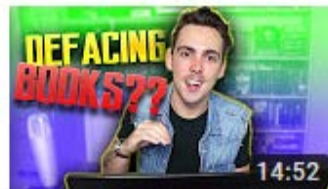
Should You Be Defacing / Writing in Books?? Wolfshot Publishing 757 views