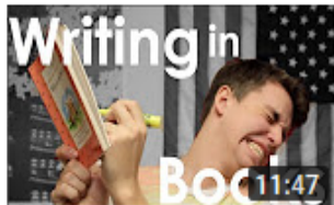
Writing in Books?! Book Ownership || Reading Critically ChapterSelect 4.4K views