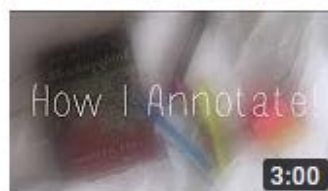
productivity 101: how i annotate books! Hollie Sikes 11K views