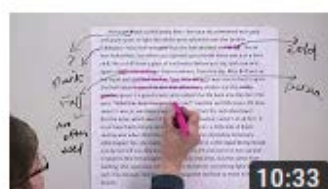
Annotating Text lesson EndOfTheHall2008 214K views