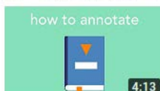
how to annotate studyign 125K views