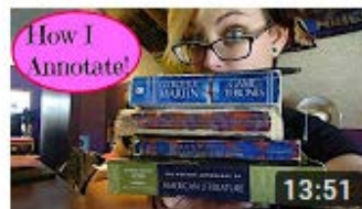
How I annotate my books Tiny Book Mouse 7.5K views